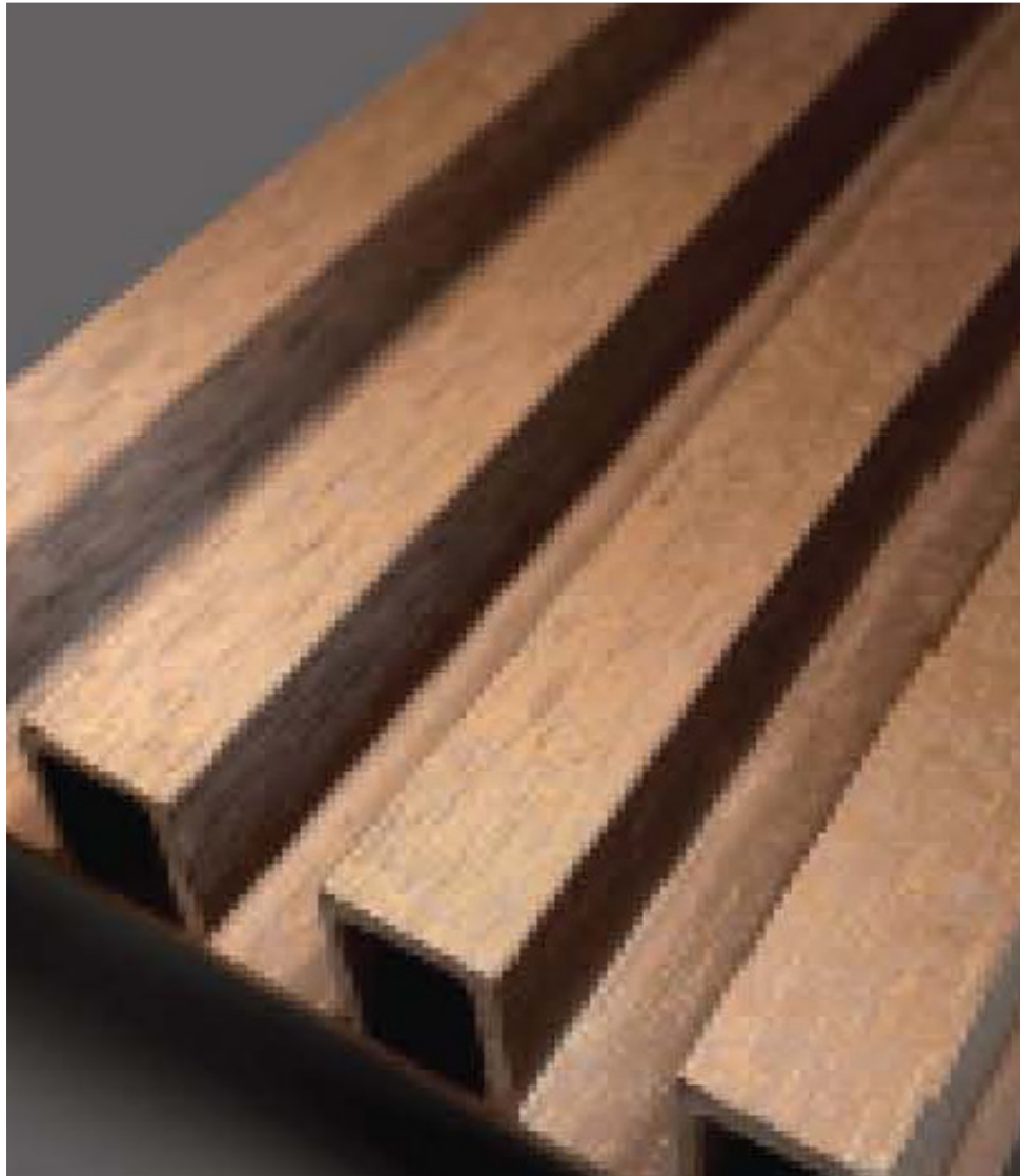
RAKED VENEER WOOD CABINET FEATURE