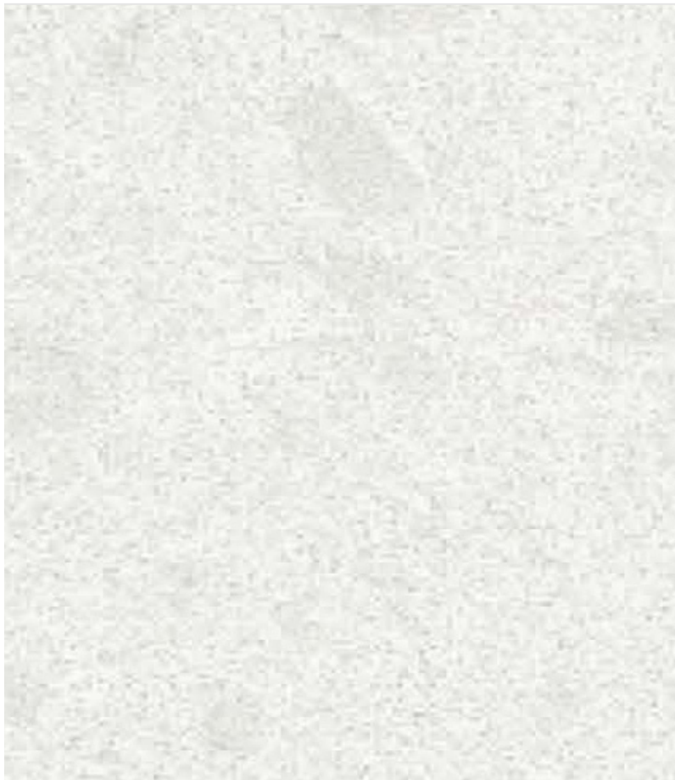
QUARTDORMS EXTREME ICEBERG WITHE 300