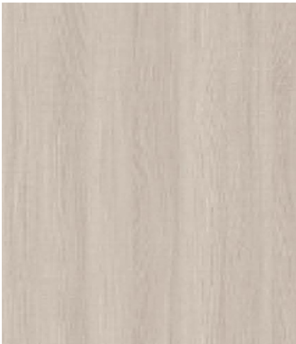
ASH LAMINATE OPEN GRAIN - JOINERY