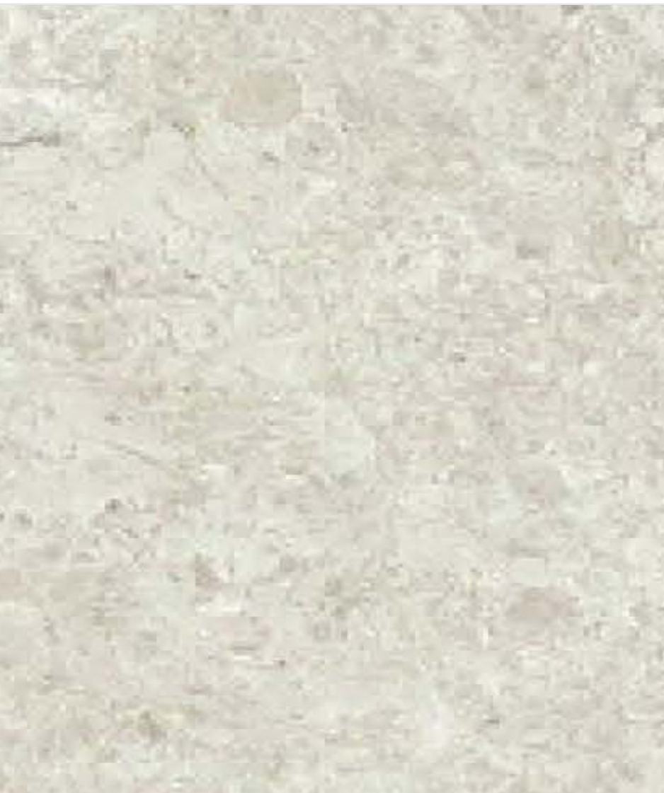
VOLAKES GENERAL FLOORING